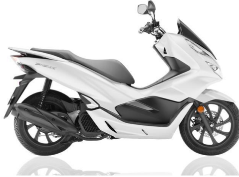
Honda PCX 125 was the best seller in June